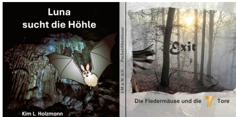
10 x 10 cm, softcover with 22 and 20 pages.

Our media library is constantly growing. We are highly productive. Following the two new booklets of the series PocketKnowledge published in fall 2025, “How I get my brain fit and keep it fit” and “Orchard fruit – On the trace of the apple,” another very nice children's booklet of the series PocketAdventure, or rather two, was launched on December 16, 2025: “Luna searches for the cave” and “Exit – The bats and the 7 gates”. Although we list the English titles of the three booklets here, they are all in German. Perhaps one or two of them can be translated into English in 2026.